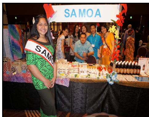
Staff of the Embassy of Samoa in Japan; Samoan community members and friends at the ALFS Charity Bazaar in Tokyo on 6 April 2016.

At this year's event, Samoa set up its handicrafts stall exhibiting and selling Samoan products and handicrafts, such as lotions, oils, soaps, handbags etc to the thousands of visitors. A food stall was also set up serving Samoan cuisine that was widely appreciated by many guests at the bazaar. The main purpose of this particular event was to raise funds to be donated to charitable institutions in each of the ALFS member countries to support grassroots/community projects that promote the welfare and education of women and children in their respective countries.