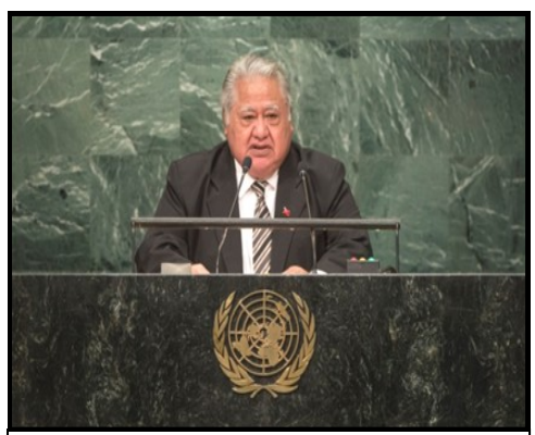
Prime Minister of Samoa Honourable Tuilaepa Sailele Malielegaoi addresses the United Nations General Assembly during its 71st Session

The Prime Minister of Samoa, Honorable Tuilaepa Sailele Lupesoli'ai Malielegaoi led Samoa's delegation to the General Debate of the 71<sup>st</sup> Regular Session of the United Nations General Assembly (UNGA) which was held from the 20<sup>th</sup> – 23<sup>rd</sup> September 2016.