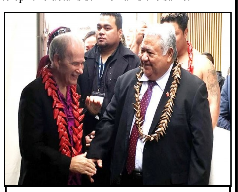
Honourable Tuilaepa Lupesoliai Sailele Malielegaoi, Prime Minister of Samoa and Mayor of

The new building, on the corner of Bader Drive and Mascot Avenue, replaces the Consulate's previous home on Karangahape Road. The Consulate General of Samoa and staff officially commenced services at their new location on Monday 19th September 2016. In this regard, only the physical address has changed but the telephone details still remains the same.